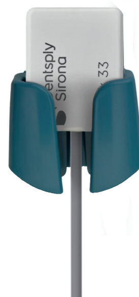
Proper storage of sensor in holster